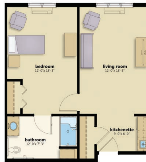
The Decatur One Bedroom Apartment 620-650 Square Feet

Enjoy amenities such as kitchenettes, state-of-the-art emergency call systems, individualized temperature controls, wall-to-wall carpeting, and window sheers. Utilities (except phone) are included, as well as cable TV and Wi-Fi ready. Housekeeping, general maintenance, and shared laundry complete services.