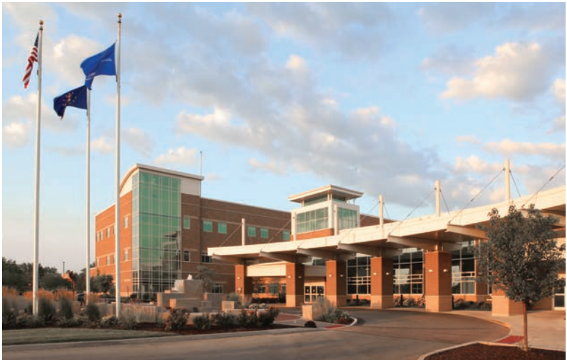
Adams Memorial Hospital

Adams Woodcrest is affiliated with Adams Health. Located approximately one quarter mile away and connected via the walking trails, Adams Memorial Hospital serves Decatur and outlying communities with a variety of healthcare services, including many specialty services such as Urology, Orthopedics, Pulmonology, and Gastroenterology. This state-of-the-art facility operates a 24-hour Emergency Room and many other services, including the Worthman Fitness Center.