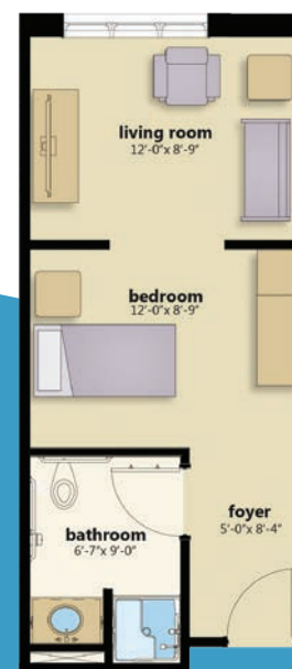
The Mercer Studio Apartment 330 Square Feet