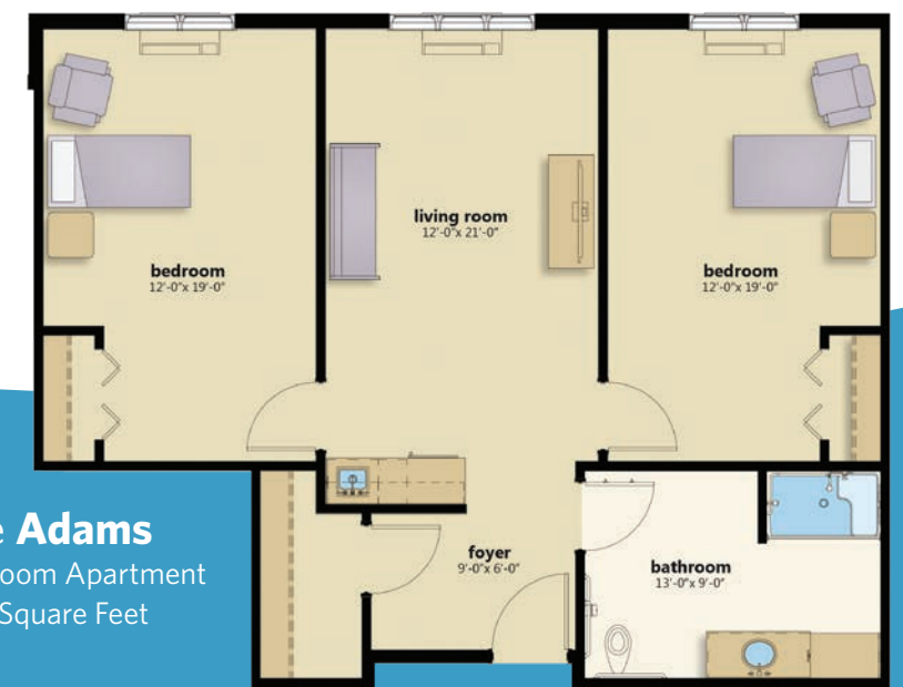
The Adams Two Bedroom Apartment 950 Square Feet